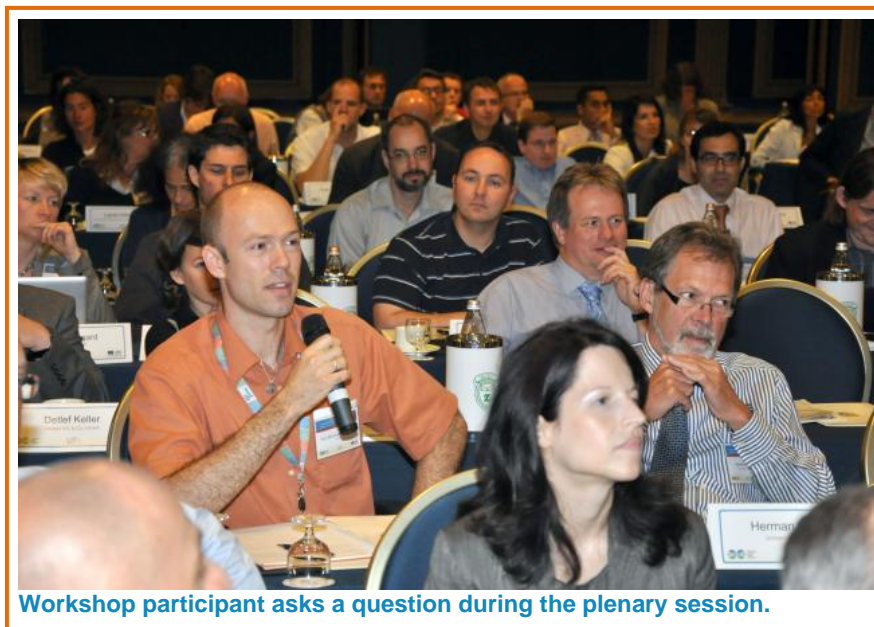
Workshop participant asks a question during the plenary session.

Undoubtedly, new cellular, analytical, and computational methods, alone and in combination, provide exciting new approaches for chemical evaluation and integrated testing strategies. However, a significant confluence of will and resources will be required to implement these strategies and to create the requisite paradigm shift in chemical safety assessments. Without a collective commitment to build capacity and to create a strategic shift, the advancements in science discussed at this workshop are likely to outpace the decision making, regulatory and policy mechanisms that need to adopt the new science.