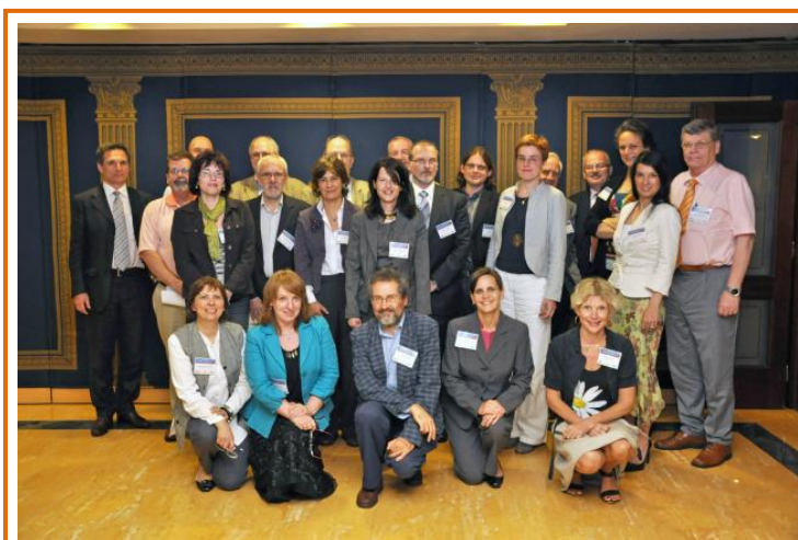
Communicating Scientific Information breakout group participants.

test sequence that includes chance nodes and decision nodes is used to generate evidence in a step-wise fashion. At every decision node, an intermediate decision is made whether to stop or to continue testing. The VOI value is positive if information from testing triggers a risk management action that differs from the action selected with prior information. The best place to start the sequence is with the test that has the highest "savings potential" throughout the sequence; a test has savings potential if the evidence gained from this test saves a subsequent test and can be performed at lower cost than a subsequent test. She concluded that VOI analysis for toxicity testing must be designed for the specific set