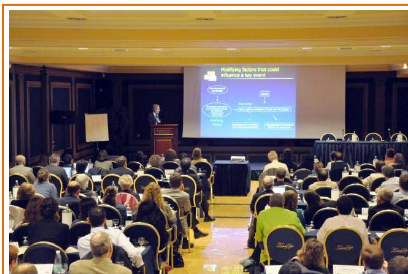
Workshop plenary session.

Findings from the workshop are detailed in this report; key outcomes include the following: