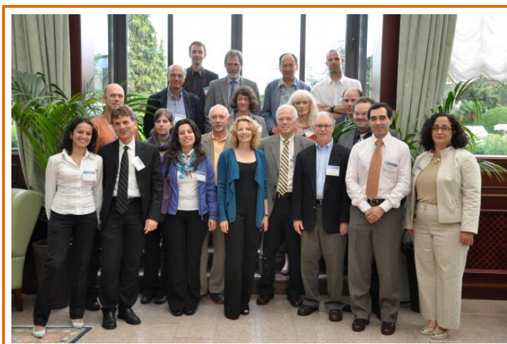
Exposure Science breakout group participants.