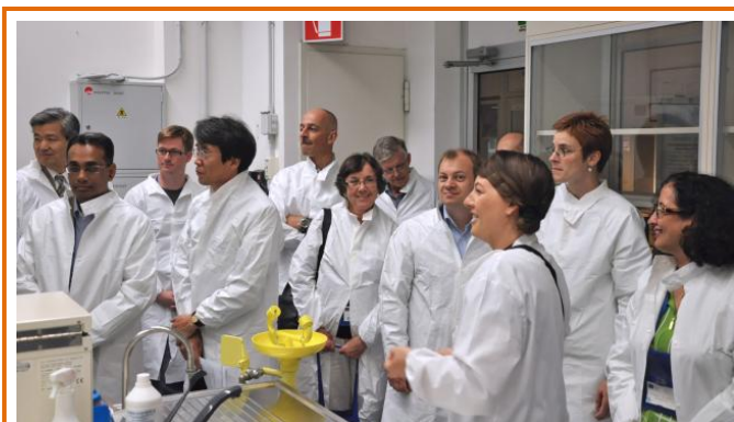
Workshop participants visit the JRC in vitro methods laboratory.

quality models that are of interest to the JRC and to consumers is data. He concluded by commenting that the next important step will be to identify meaningful approaches to integrate information from (Q)SARs, 'omics', HTS and in vitro results to predict in vivo outcomes.