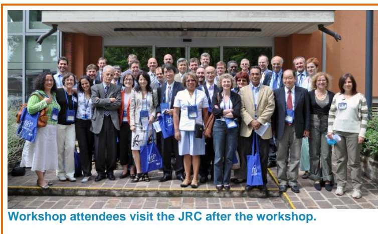
Workshop attendees visit the JRC after the workshop.