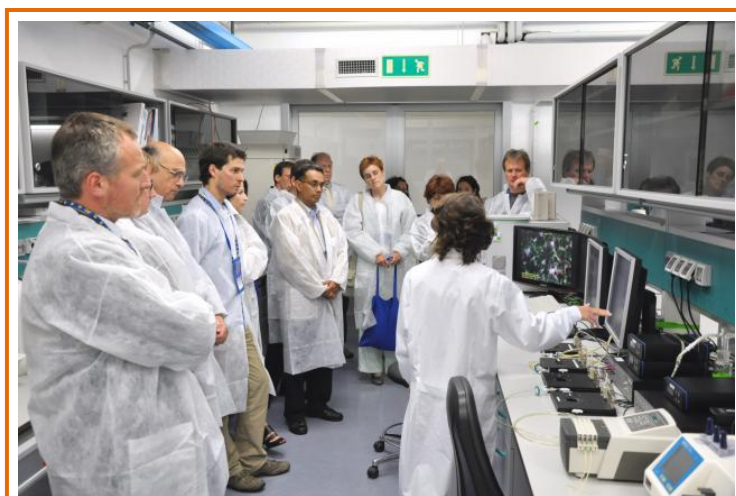
Systems toxicology laboratory at JRC.