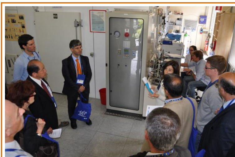
Workshop participants tour the Indoortron laboratory at JRC following the workshop.

As an example of the importance of mutual understanding, he noted that the molecular acronym TCE that might be used by a toxicologist could suggest three different compounds to chemists, trichloroethylene, tetracyanoethylene, and trichloroethane. Using caffeine as another example, he observed that the physical and chemical properties listed for this compound differ in the literature for the two fields. He then reviewed a challenge that he had to calculate the solubility of 32 different chemicals using a database of 100 reliable measurements. The outcome was that the literature data on solubility was not good and that actual measurements of solubility further identified the difficulty in finding one correct solubility value. He concluded by noting that